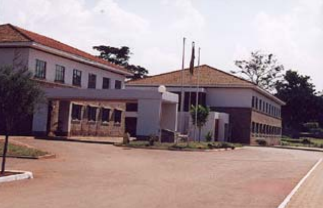
Figure 2. Plan of KISM Photo 1 Administration Block and Classrooms of KISM.