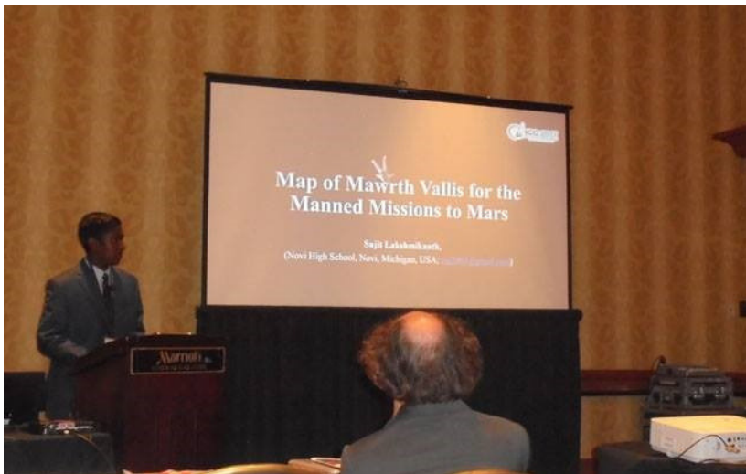
Participants of the Joint ICA Workshop: different fields - one cartography