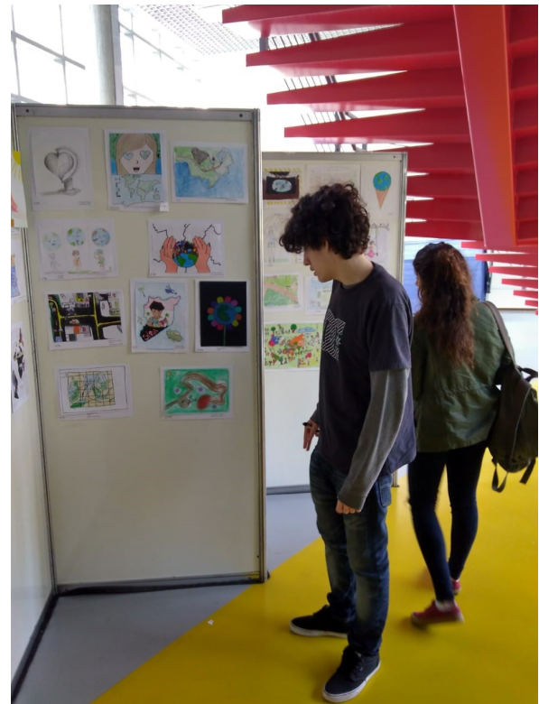
Photos showing the Children's Map Competition 2018 - Livia de Oliveira Award (National Competition) The national competition also selects the drawings that will be in the Barbara Petchenik Competition, in Tokyo 2019, and some activities of the Meeting