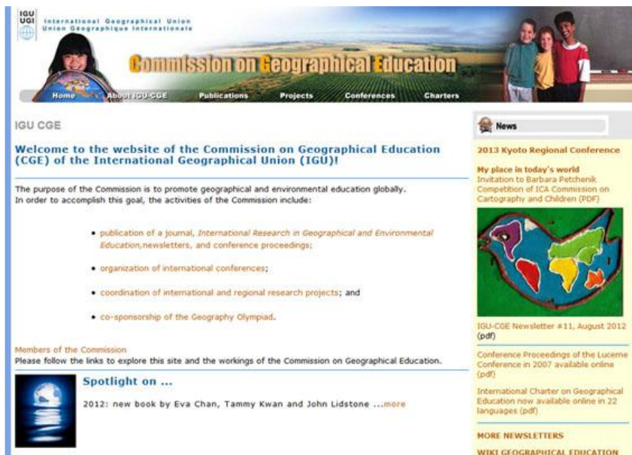
Website of the IGU Commission on Geographical Education ( http://www.igu-cge.org/index.htm )

As one of the results of our contacts during the event, actually an Official Invitation for the participation in the 2013 Barbara Petchenik Competition (signed by ICA President and Commission Chair) can be read and downloaded in their website ( http://www.igu-cge.org/ ), and this invitation will be also include in their next newsletter.