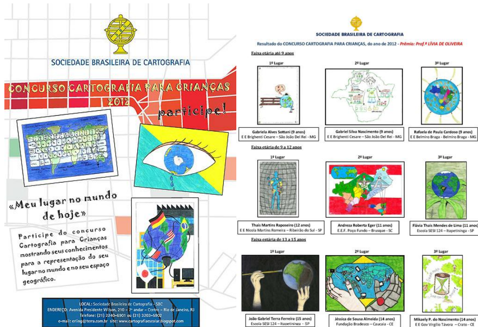
Left: Call for the National edition of the Barbara Petchenik Competition in Brazil (2012), organized by their national Cartographic Association. Right: Winner entries of the National Competition this year (a selection of them will represent Brazil in the Barbara Petchenik International Competition 2013)