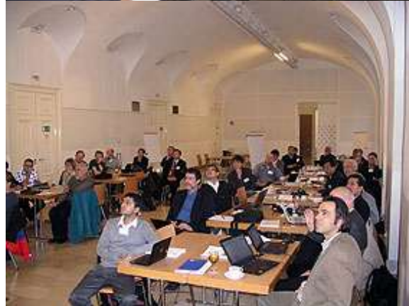
Images from the ICA Commission Chairs Meeting (Vienna, 24-25 November)