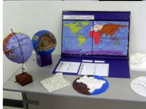
Photos taken during the VII National Workshop on Cartography for Children and Pupils (Vitoria, 26-28 October)